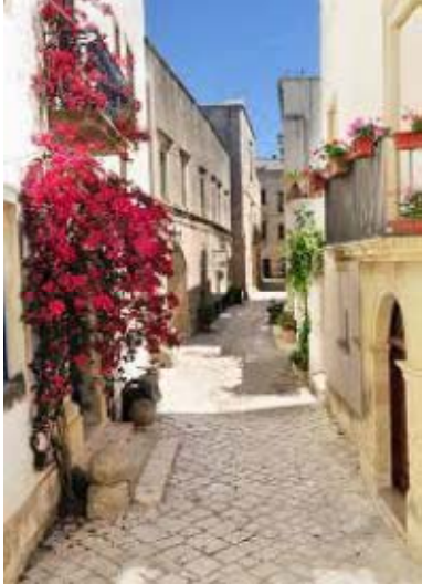
HOTEL MESSAPIA – SANTA MARIA DI LEUCA