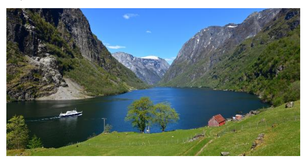
Finally you'll be back in Bergen where you stay from the 19<sup>th</sup> to the 21<sup>st</sup>, then it will be time to and leave. You will leave Norway from Bergen Airport Flesland.